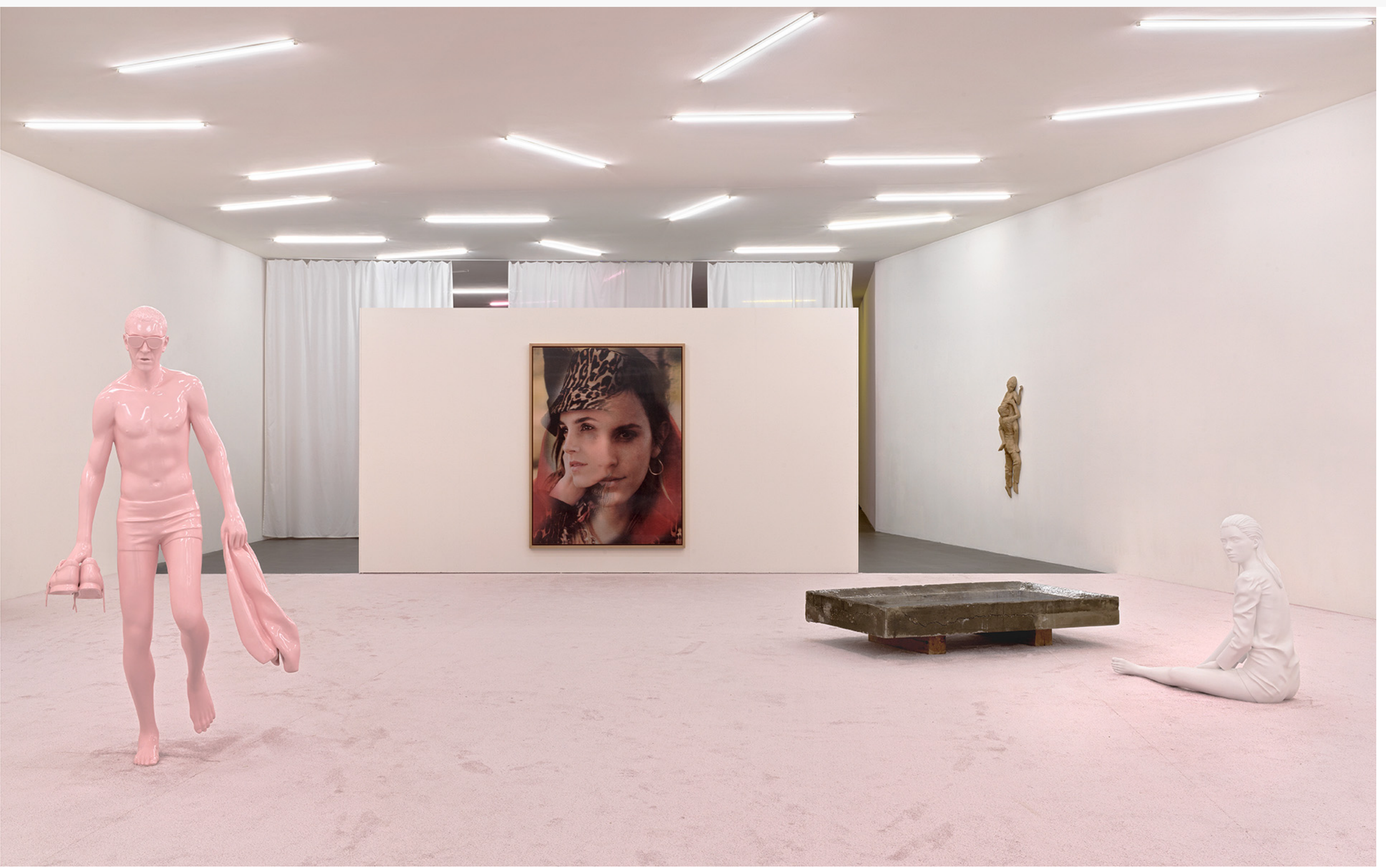
Installation view of the exhibition "Yves Scherer: Candid's" at Kunsthaus Grenchen in Grenchen, Switzerland.