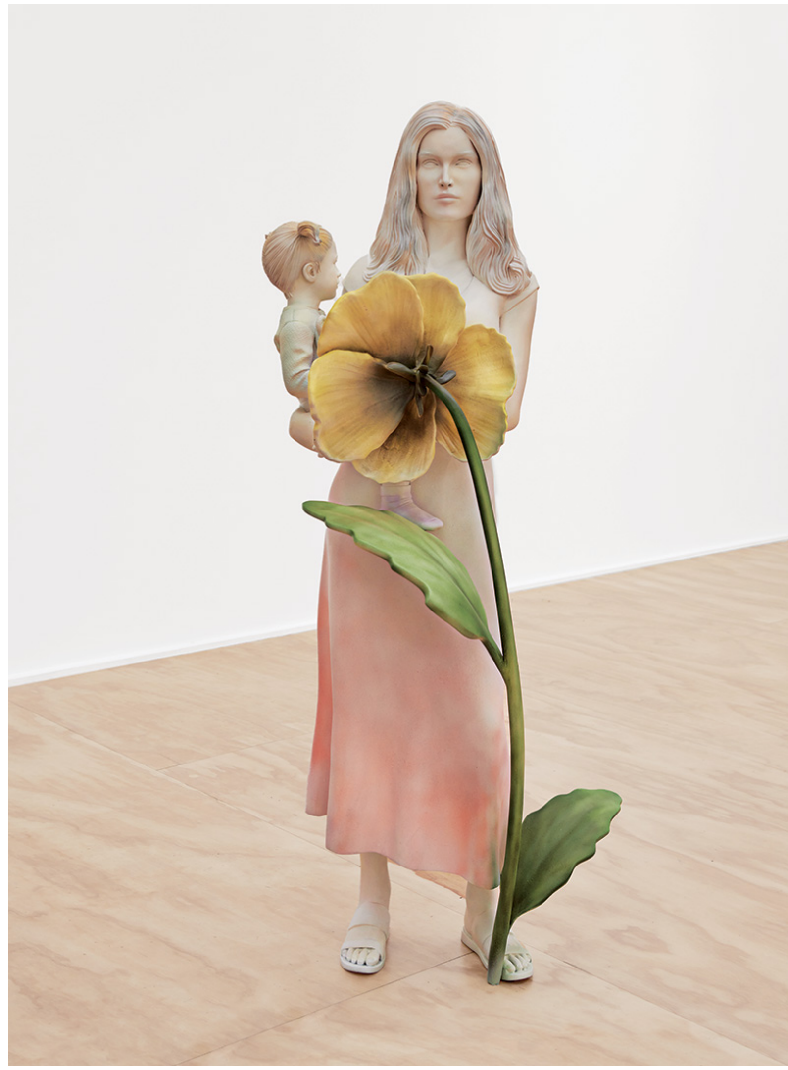
Yves Scherer, Lactitia , 2021.

Tools of the trade: Conceptualized using everything from iPhone photos to high-tech computer software, the works are made from 3D-printed aluminum, then presented in installations alongside lenticular photographs, portraits, or mixed-media works.